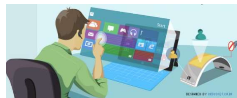
Figure 2: Example of an adaptive user interface that monitors and tracks the user’s interactions to provide assistive functionalities.

https://doi.org/10.1186/s13638-019-1526-x