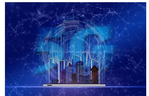
Figure 2: We explore Time-Sensitive Networking in 5G contexts... paving the way towards a reliable 6G?

https://www.iotworldtoday.com/connectivity/the-next-chapter-in-the-world-of-iot-addressing-the-new-wave-of-the-iot-with-edge-ai